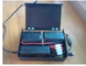
14 amp hour / 140 watt hour lithium ion battery by Noblenutria