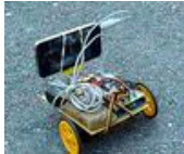
Skype-controlled robot using smartphone and DTMF tones (Photos) by janisalnls