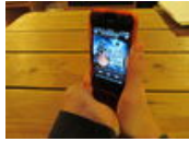
How to amplify your iPhone speakers...with your hands! by techwhisperer