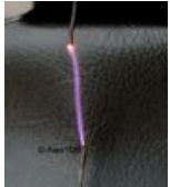
555 timer based plasma speaker by Alex1M6