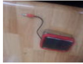
Solar Minty Boost Amp/Battery Booster by ShadowHakr