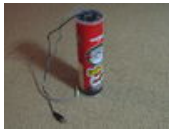
Pringles Can Speaker by hunter13