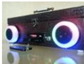
Pringles ghetto blaster by Milen