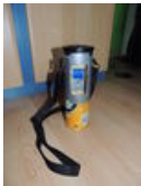
Pringles Speaker with Build-in MP4 (video) by lukeD